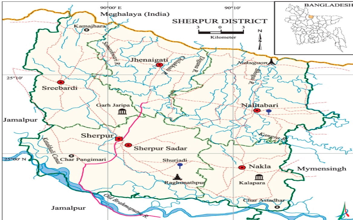
Figure 2. Location of the study area.

For necessary comparisons, a total of 80 respondents involved in small-scale agricultural farming under the category of homestead gardening, poultry, and dairy farming were interviewed.