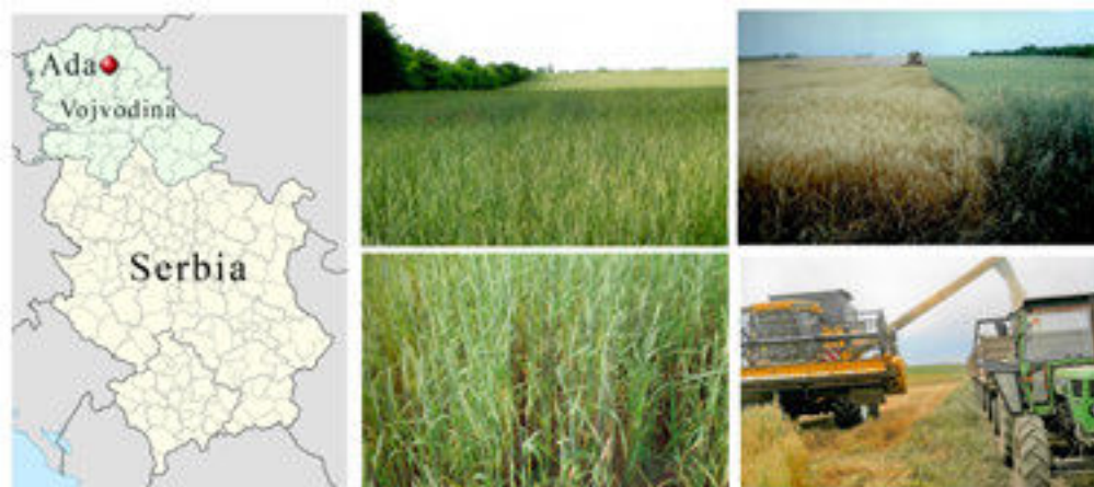
Figure 1. Location of study area and photos of the organic production and harvesting of spelt in a fields of Bio Farma doo in Ada during the study period